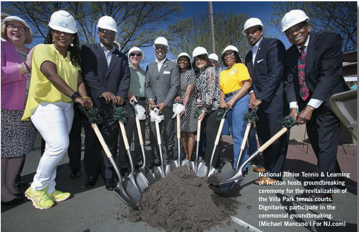
National Junior Tennis & Learning of Trenton hosts groundbreaking ceremony for the revitalization of the Villa Park tennis courts. Dignitaries participate in the ceremonial groundbreaking.

TRENTON — The cracked and worn tennis courts at Villa Park are getting a $100,000 overhaul, thanks to public-private partnership to fund it.